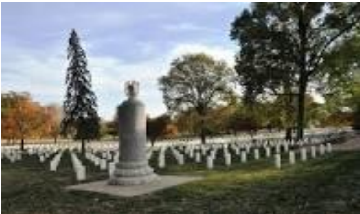
Fort Leavenworth National Cemetery

*As a note at the Battle of the Little Bighorn (June 1876) not only did Lt Colonel George Custer die but two of his brothers, Boston and Thomas, also died as well as his brother-in-law First Lieutenant James Calhoun.