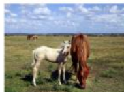
Free to Use and Reuse: Horses