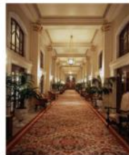
Free to Use and Reuse: Hotels, Motels & Inns