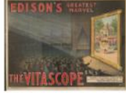
Free to Use and Reuse: Motion Picture Theaters