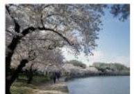
Free to Use and Reuse: Cherry Blossoms