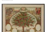
Free to Use and Reuse: Genealogy