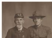
Free to Use and Reuse: Veterans