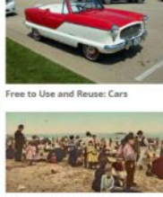
Free to Use and Reuse: Get Into the Swim