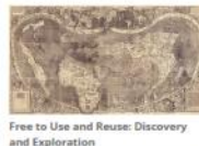
Free to Use and Reuse: Discovery and Exploration