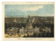
Free to Use and Reuse: Maps of Cities