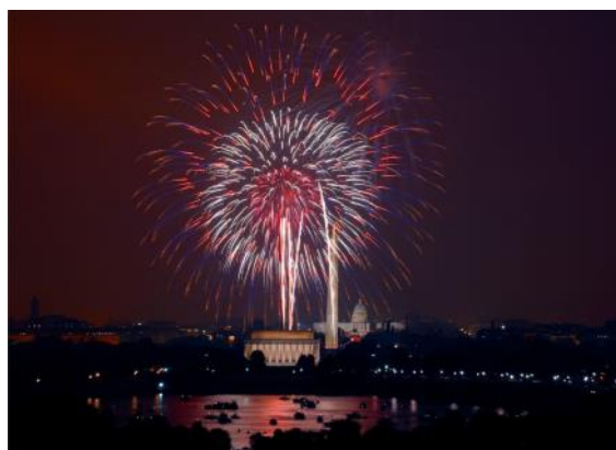
July 4th fireworks, Washington, D.C. July 4. Photograph.

Happy 4th of July! We hope you are all well during this unprecedented time we are in. While we would love to meet in person, we watch the numbers of cases in our county climb and are happy to be able to offer some meetings via ZOOM. Isn't technology wonderful!