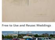
Free to Use and Reuse: Cars