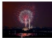
Free to Use and Reuse: Independence Day

These sets are just a small sample of the Library's digital collections that are free to use and reuse. The digital collections comprise millions of items including books, newspapers, manuscripts, prints and photos, maps, musical scores, films, sound recordings and more. Whenever possible, each collection has its own rights statement which should be consulted for guidance on use. Learn more about copyright and the Library's collections.