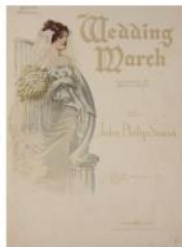
Free to Use and Reuse: Weddings